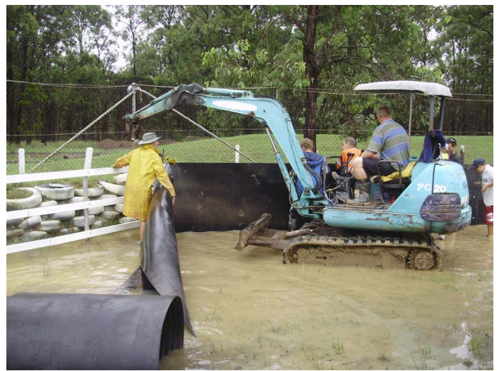
Above: The Pits would have been a great spot for a Jet Ski Race. Hope the Guys and Girls didn't mind wet boots .